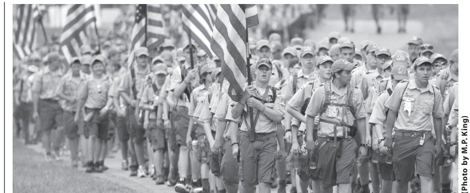
Troop 1423 of the Bay-Lakes Council leads a group of Central Region Scouts mobilizing for the opening arena show at the 2010 National Scout Jamboree at Fort A.P. Hill.

See page 3 for suggested arena show checklist and safety tips.