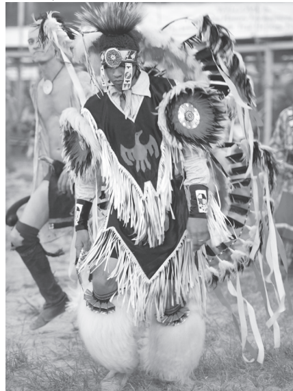
A dancer from the Tipisa Lodge performing in the OA pow wow.